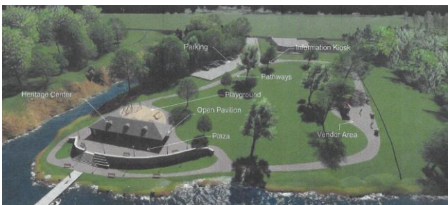
Rendering of potential use of the park land