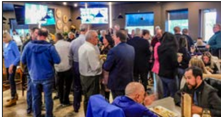
Close to 80 people attended the Mix & Mingle held at Wise Guys Ristorante March 12.

The Lyme Community Foundation, located at the Alexander Copley House in the village of Chaumont, supports our community through learning, cooperation and enrichment. Many programs are available throughout the year to serve the visitors and residents of our community.